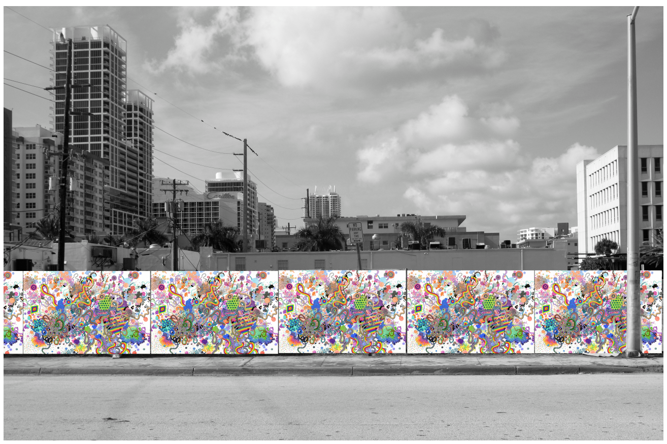
Unrealized Project: Construction Barriers for North Beach, Miami Beach