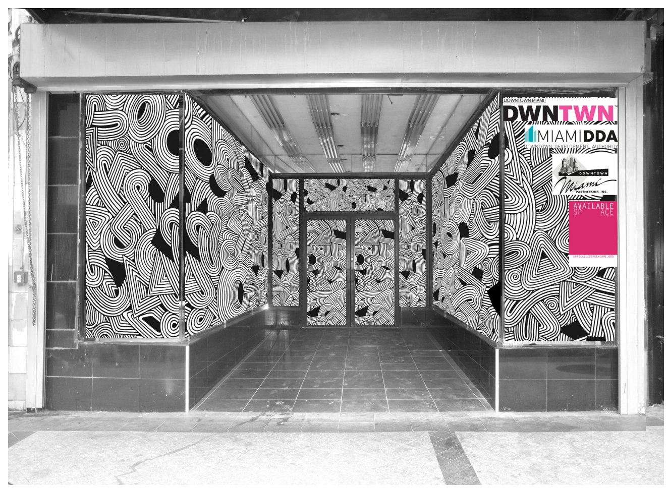
Unrealized Project: vinyls for vacant storefronts, Downtown Miami Development Authority